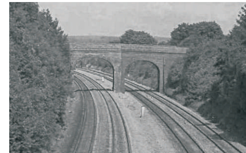
Purley Lane Bridge, wider on left because of original broad gauge track.

The GWR ran to a gauge of seven feet which enabled trains to be much bigger, faster and more stable, but the rest of the country were adopting Stephenson's standard gauge of 4ft 8½ ins. The Manchester and Southampton Railway got the right to build a standard gauge line in 1844 which meant that the GWR from Birmingham to Basingstoke had to have dual gauge track. Eventually the complications of dual gauge became so uneconomic that finally the GWR gave way and the last Broad Gauge train ran in 1892.