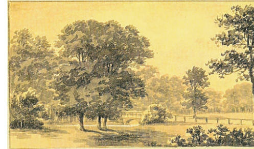
Suggestion for a bridge from the Purley Red Book